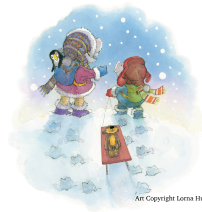
Art Copyright Lorna Hussey 2016

Want a quick way to make hot chocolate? Measure 2 tablespoons of powdered milk, 2 tablespoons of powdered confectioner’s sugar, and 1 tablespoon of baking cocoa into a coffee cup. Whisk it together until there are no lumps. Add 1/2 cup of boiling water and whisk again. Try marshmallows or whipped cream on top to make it extra-special! It’s delicious on a snowy day!